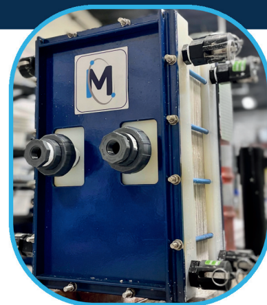
Low pressure TDS removal at high recovery